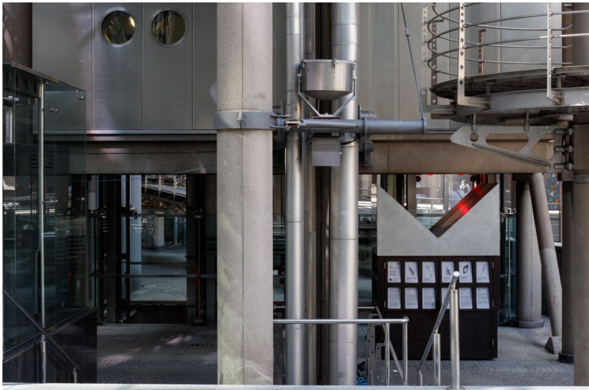
Voicing Pod at Lloyd's Building, Street Assemblies by Urban Radicals, LFA2024 © Luke O'Donovan