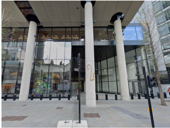
2. Horizon 22 Intervention Location