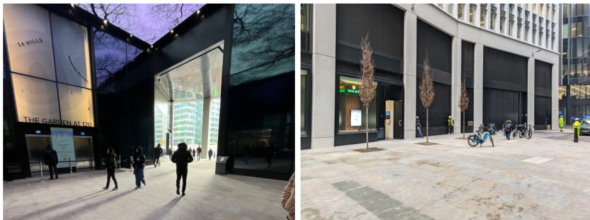
1. The Garden at 120 (Location 1a left) (Location 1b right)

The project will focus on four key locations near the viewing platforms, each offering opportunities for tailored interventions, like the addition of public seating and larger information points (on the plan above showed as ‘Intervention’ locations 1-4). Other smaller adjustments, such as improved signage and wayfinding, could also be considered for the ‘Marker’ locations as outlined in the plan.