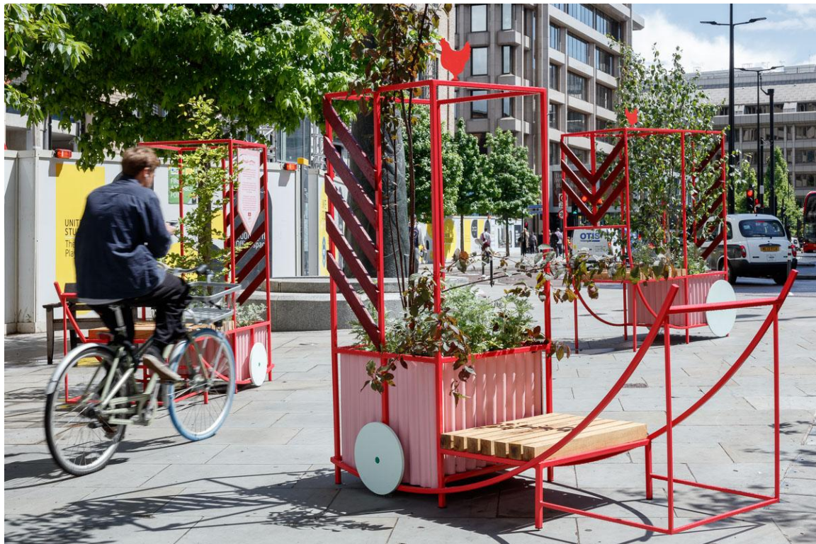
The Mobile Arboretum by Wayward Plants for Aldgate Connect