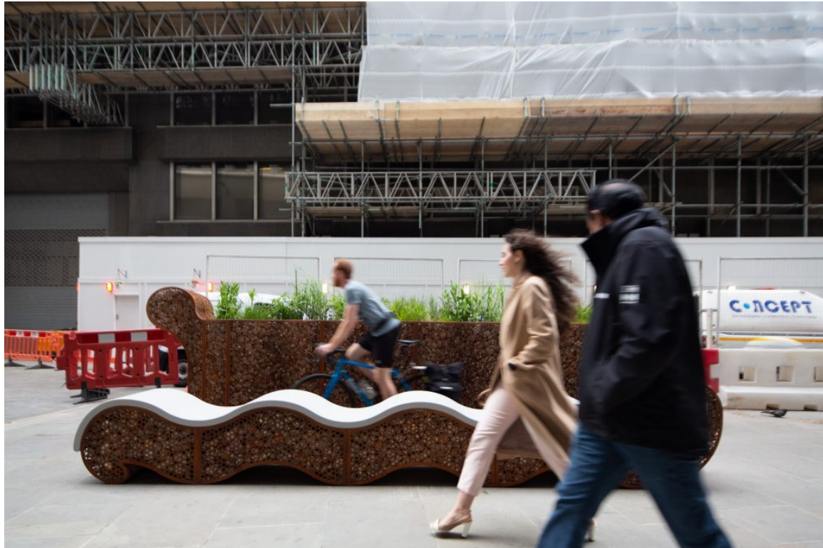
Rocks and Reeds by PARTI for City of London