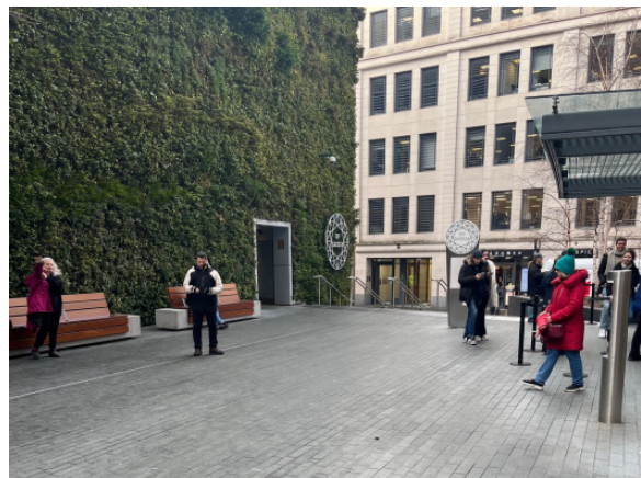
4. The Sky Garden Intervention Location (left) and Marker Location (right)

While these spaces are an important part of the City's visitor offering, feedback has shown that they are not clearly signposted at street level, and wayfinding to other City destinations and transport hubs is insufficient.