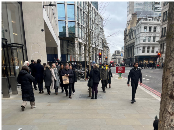
3. The Lookout Intervention Location